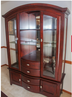
Large China Hutch