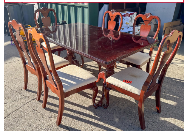
High Gloss Dining Table with 6 Chairs & Leafs