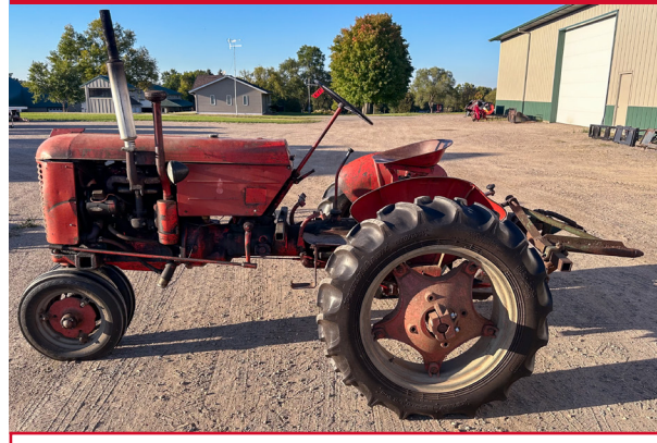
Case VAC Tractor, Eagle Hitch 2 Bottom Plow, Cultivator, Weights, Chains