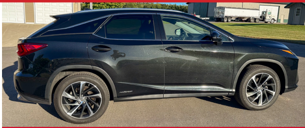
2017 Lexus RX450H Hybrid SUV Sunroof, Navigation, 51,411 Miles, Vin #2T2BGCA0HC009326, Very Clean Car!

(BEST VIEWING OF SMALL ITEMS, PLEASE SEE PHOTOS ON OUR ONLINE AUCTION SITE AS ALL ITEMS ARE BOXED) OVER 600 LOTS SELL!