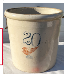
Red Wing 20 & 6 Gallon Crock Jars