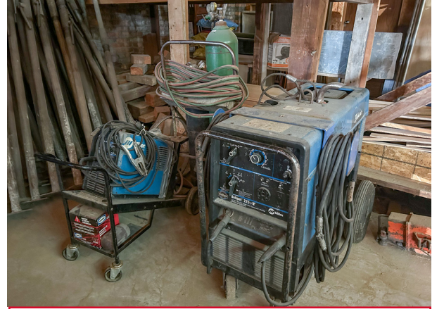
Miller Bobcat 225NT CC/CV AC/DC 8000-Watt Generator/Welder Miller 130 FP Wirefeed Welder with Cart