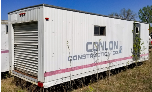
3 Portable Construction/Office Trailers NEW CONSTRUCTION MATERIALS