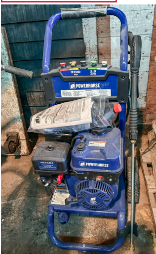
Powerhorse 3100 PSI Pressure Washer