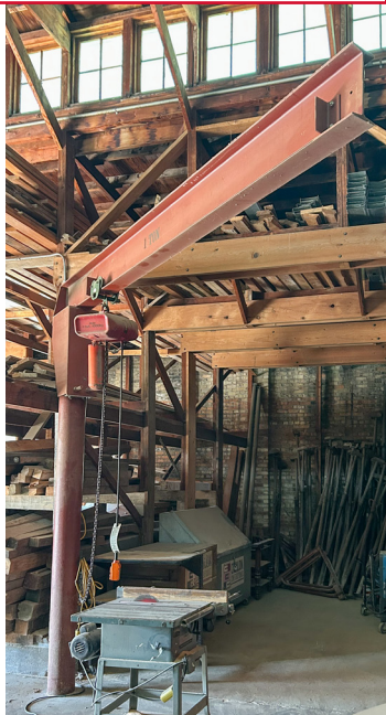
Jib Crane with 1 Ton Hoist