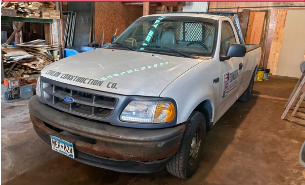
1997 Ford F150 4 x 2 Pickup 83,000 miles