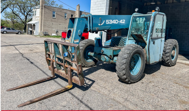
Gradall 534D-42 All Wheel Drive Telescoping Boom Forklift Diesel Engine

PREVIEW WEDNESDAY MAY 14TH 4:00 P.M.- 7:00 P.M.