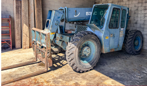
Gradall 534C-34 All Wheel Drive Telescoping Boom Forklift Diesel Engine